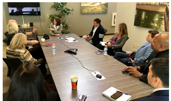
Senator Cortez Mastos Meeting with the board.