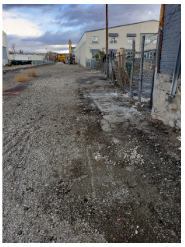
Before and after of a camp clean up.