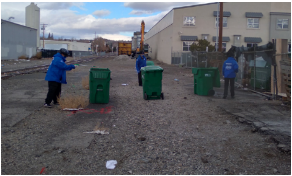
Ambassador team cleaning up next to businesses along the railroad tracks.