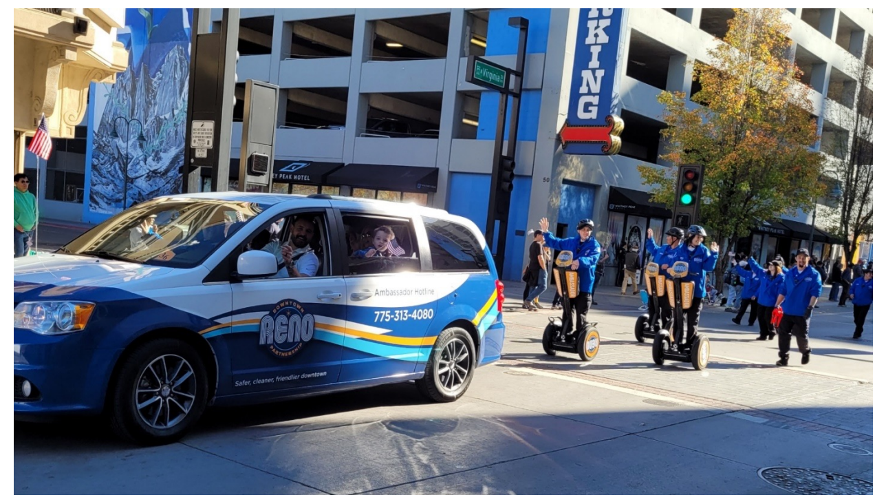
Ambassadors in the Veterans Day Parade