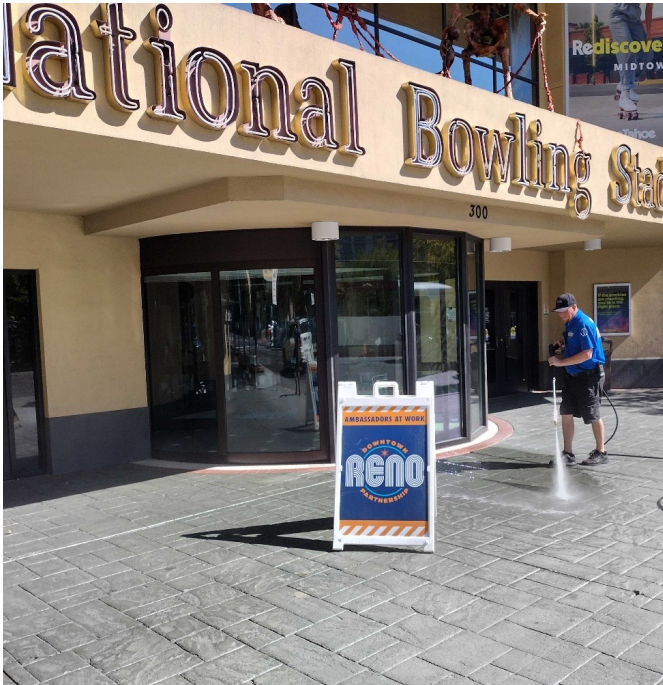
Ambassador Wade pressure washing the National Bowling Stadium.