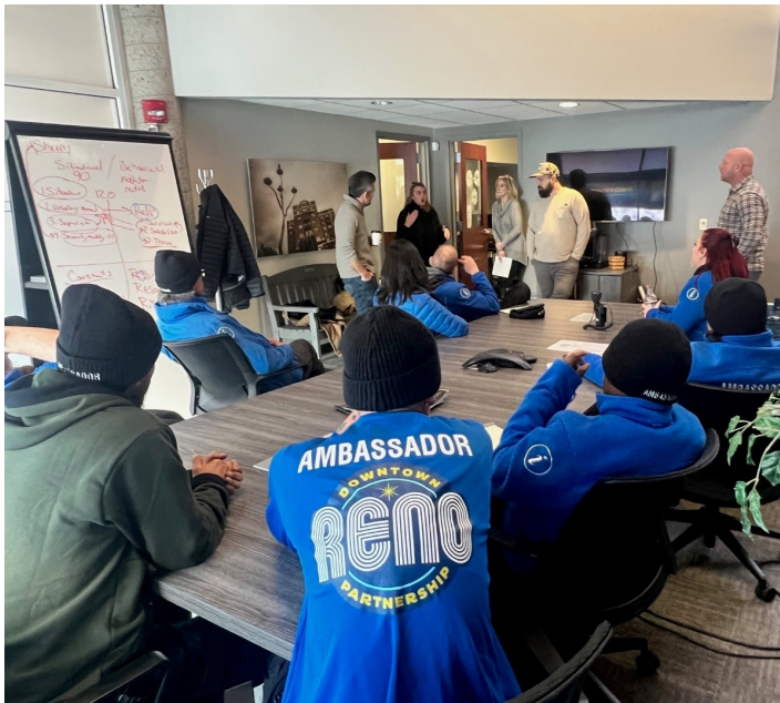
Ambassadors meeting with stakeholders to promote relations in the BID.

DOWNTOWN RENO BUSINESS IMPROVEMENT DISTRICT HOSPITALITY AND STREET OUTREACH PROGRAM | JANUARY 2023