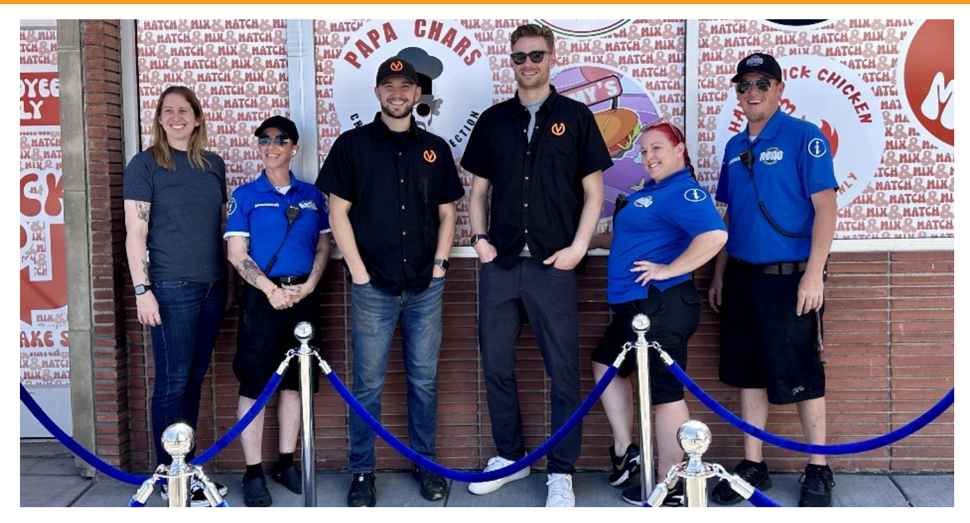
Ambassadors welcoming new business to Downtown Reno