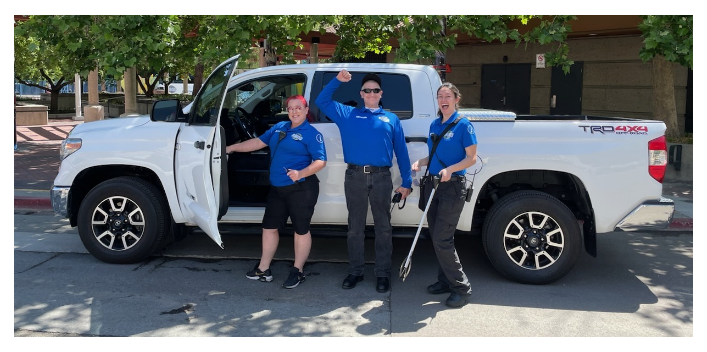
Ambassadors removing a truck full of Garbage that the team helped clean up.